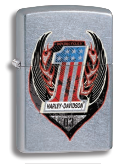
29347 Street Chrome Color Image