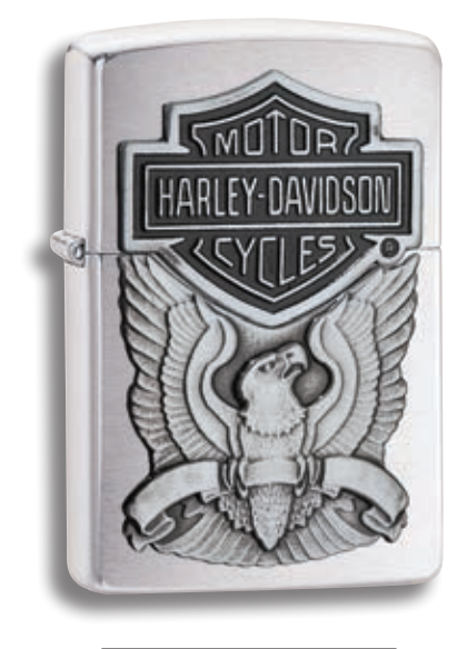
200HD.H284 Brushed Chrome Emblem Attached