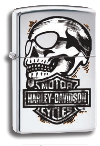
29281 High Polish Chrome Color Image