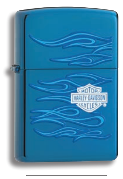
20711 High Polish Blue Color Image