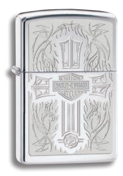
28982 High Polish Chrome Laser Engrave / Auto Engrave