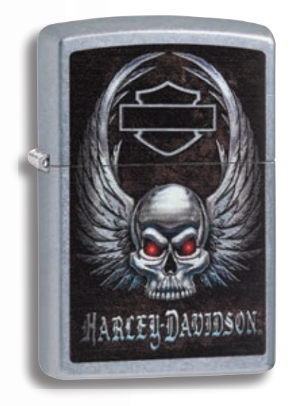
29558 NEW Street Chrome Color Image