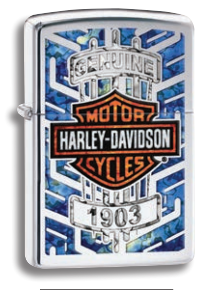
29159 High Polish Chrome Fusion