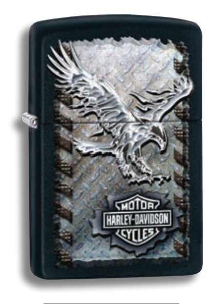
28485 Black Matte Color Image