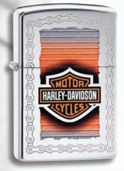
29559 NEW High Polish Chrome Color Image/Lustre