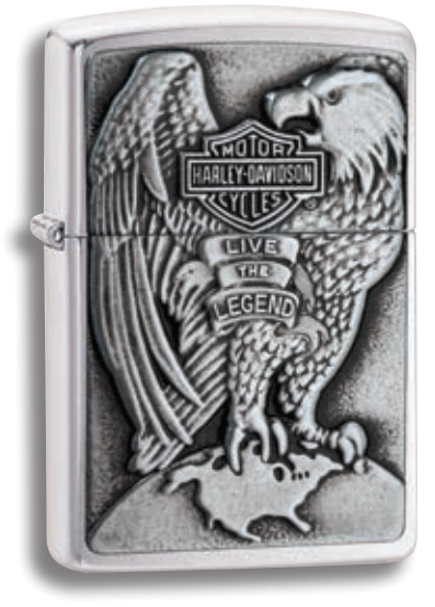
200HD.H231 Brushed Chrome Emblem Attached