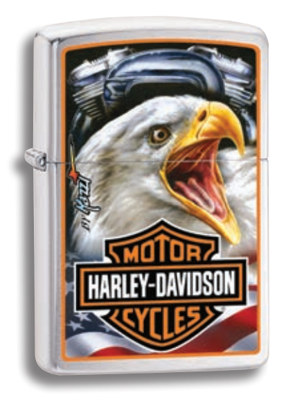
29499 NEW Brushed Chrome Color Image