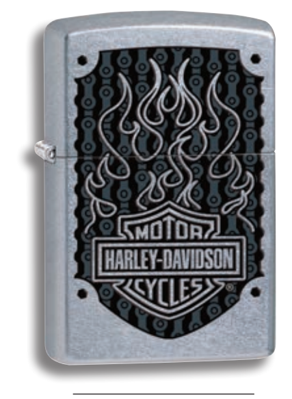
29157 Street Chrome Color Image