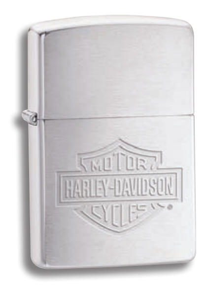
200HD.H199 Brushed Chrome Lustre