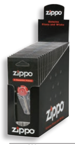
2406N 6 Flints Plastic Dispenser

For optimum performance of every Zippo windproof lighter, we recommend genuine Zippo flints, wicks, and premium lighter fluid.