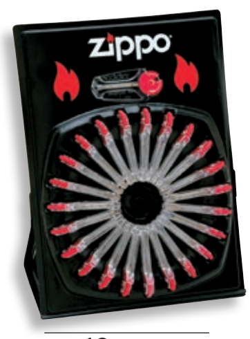
2406C 6 Flints Plastic Dispenser