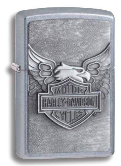
20230 Street Chrome Emblem Attached