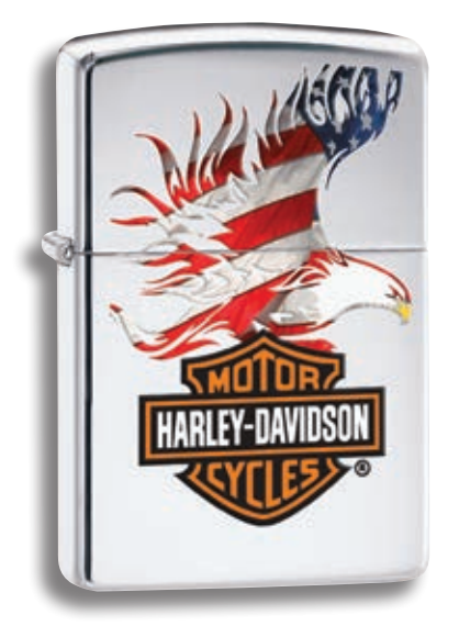
28082 High Polish Chrome Color Image