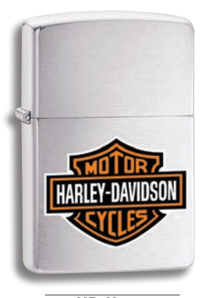
200HD.H252 Brushed Chrome Color Image