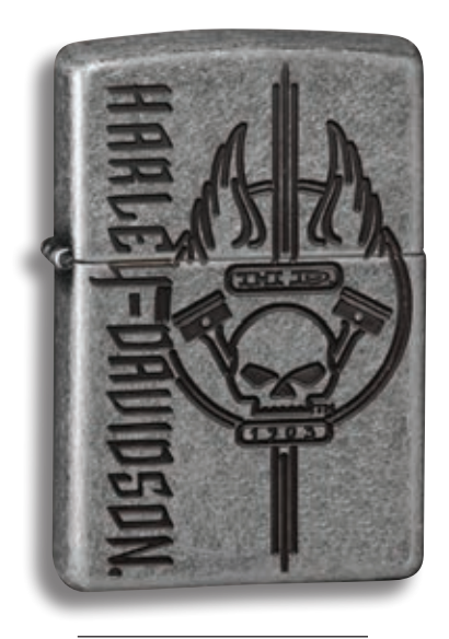
29280 Armor Antique Silver Plate Deep Carve